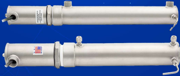
CRES-ILB Heaters – Threaded/Compression/VCR/etc